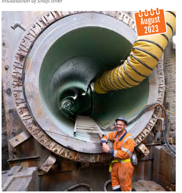
Tunnel to PS25 completed