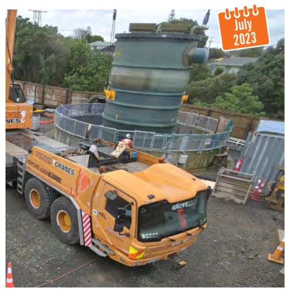
Installation of shaft liner