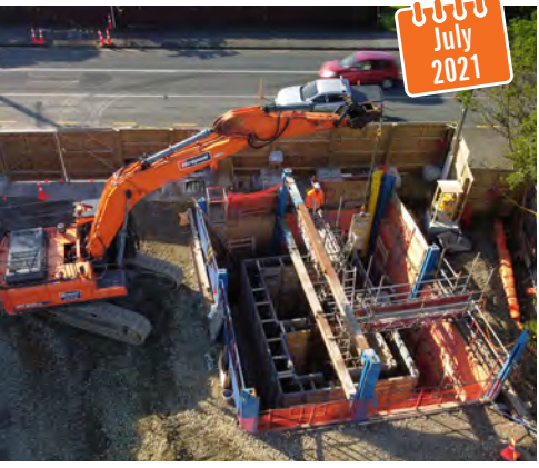
Excavations begin on chamber